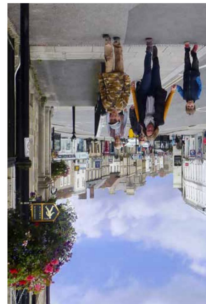
Created by volunteers from Warminster group of Get Wiltshire Walking