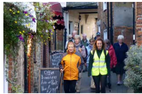
Connecting Wiltshire Further information about travel in Wiltshire can be found on www.connectingwiltshire.co.uk