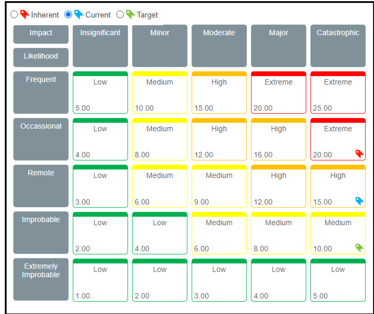
Fig. 2 Heat Map displaying the likelihood and impact of Environmental damage to the Splashpad

To reduce the risk further, a target has been set to offer all splashpad staff refresher training before the splashpad reopens. This will reduce the likelihood of damage occurring from remote to improbable, reducing the overall risk from high to medium.