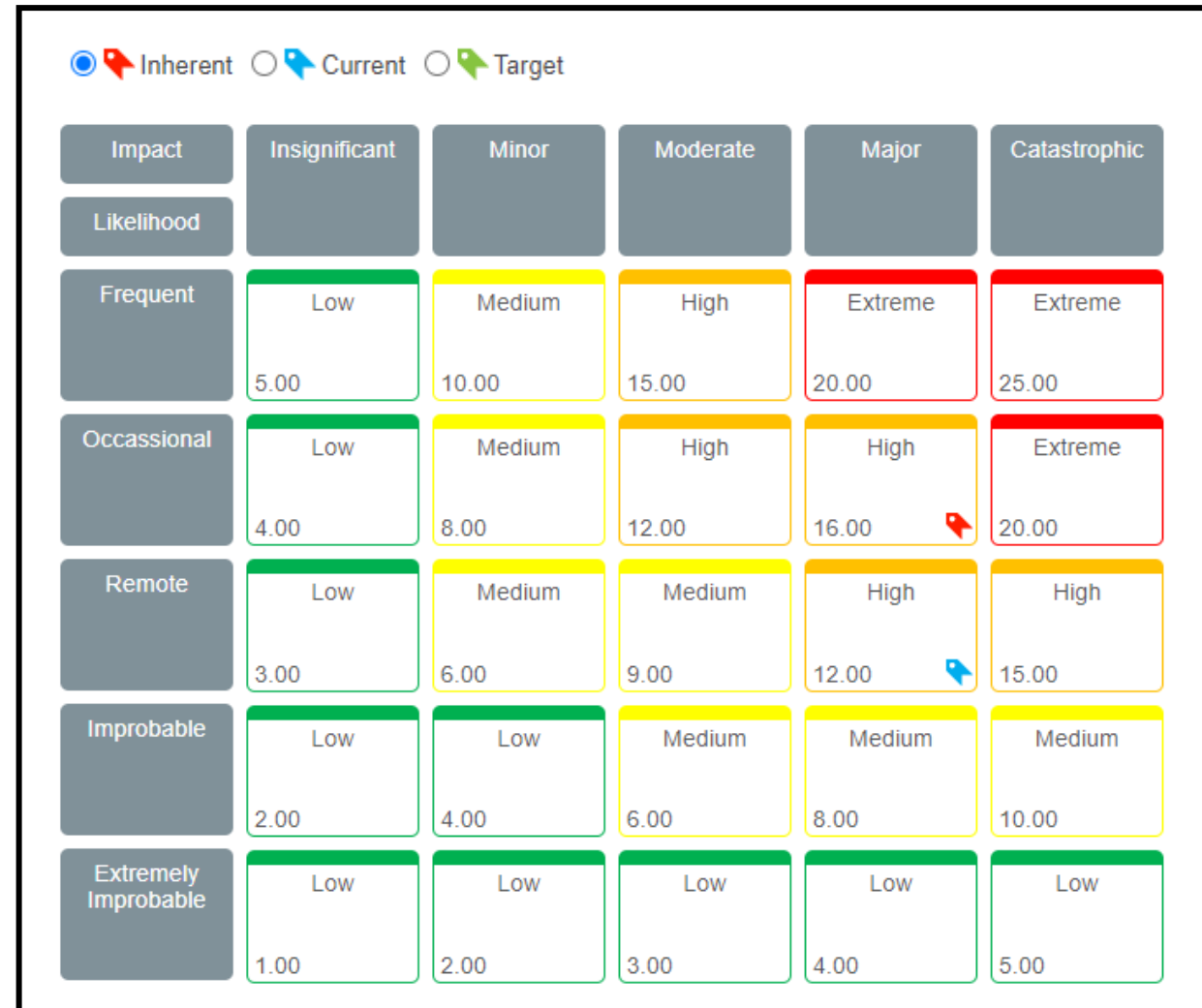
Fig. 3. The risk of physical damage or injury occurring at the Skatepark. With controls in place the likelihood of this risk is reduced but because the impact would still be major if it did occur the risk remains high.