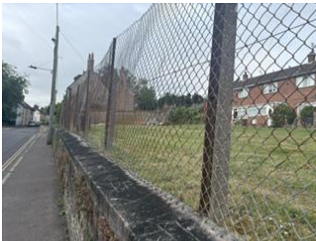
Above Picture East side of the park