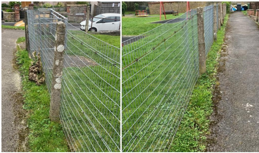
Above Picture West side of the park