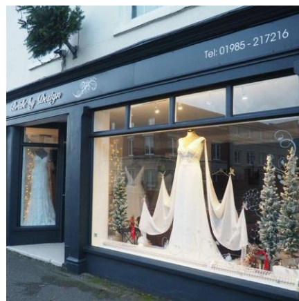
Winner 2020, Bride By Design

Every Christmas window display will be automatically entered into the Christmas window competition. Look out for photographs on the Warminster Town Council Facebook page and tell us which is your favourite.