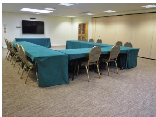
The Cley Room

If you would like to hire a room for a meeting, training or group please get in touch. The rooms are bright and clean with access to WI-FI and audio-visual equipment.