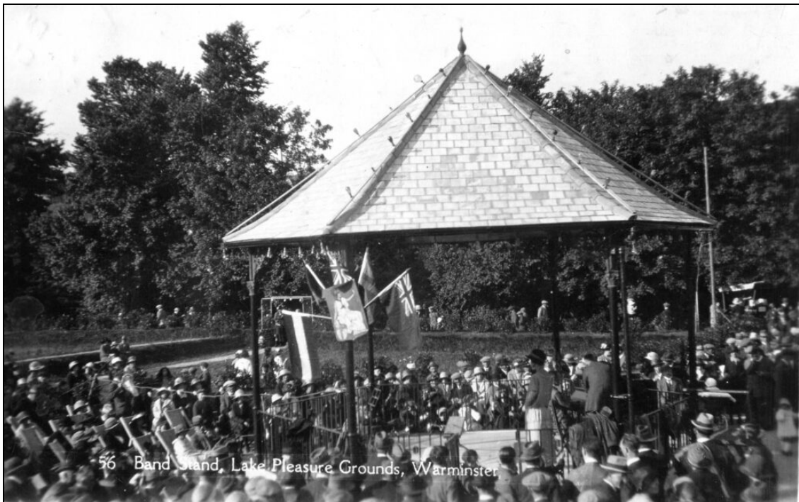
56 Band Stand, Lake Pleasure Grounds, Warminster