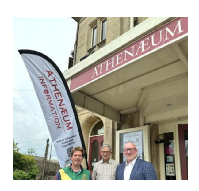
Warminster Information Point