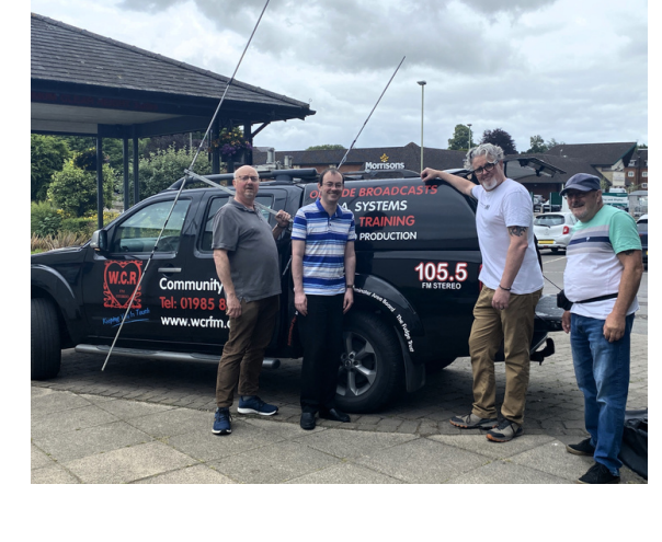
Warminster Community Radio